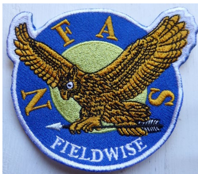
Owl Patch (8.5cm dia.) Code: 401 £2.50 each