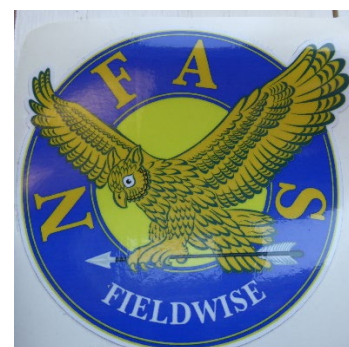
Owl Car Sticker (9.5cm dia.) Code: (Internal) 601A £1.50 Code: (External) 601B £1.50