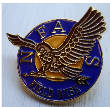
Owl Pin Badge (2.5cm dia.) Code: 501 £3.50 each