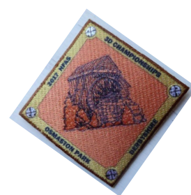
2017 3Ds Patch (6.3cm sq.) Code: X03 £1.00