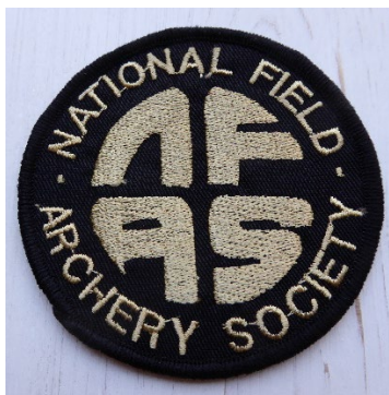
NFAS Patch (8.5cm dia.) Code: 402 £2.50 each