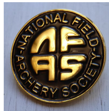
NFAS Pin Badge (2.5cm dia.) Code: 502 £3.50 each