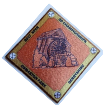
2017 3Ds Patch (9.0cm sq.) Code: X02 £1.50