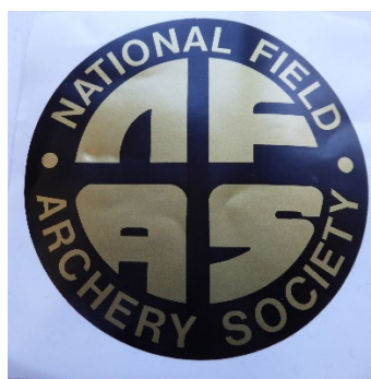
NFAS Car Sticker (8.0cm dia.) Code: (Internal) 602A £1.00 Code: (External) 602B £1.00