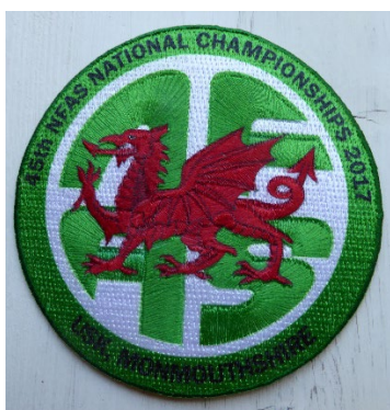
2017 Nats. Patch (8.8cm dia) Code: X04 £1.50