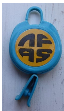
NFAS Clip Code: Y01 £2.50