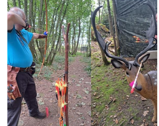
Black Shoot Report 10<sup>th</sup> September 2023

We've all heard of a lucky leg but what about a lucky ear? Cleverly aimed through the horns! As you can see the Stag shot is not for the faint hearted and remember there is no trees. I wish someone had told me that!